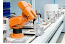
AUTOMATION & ROBOTICS