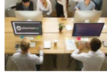
TRAINING & DEVELOPMENT