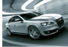
AUTOMOTIVE & MOTORSPORT