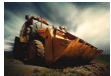
OFF HIGHWAY VEHICLES & EQUIPMENT