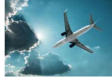
AEROSPACE & AVIATION