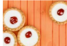
FOOD & DRINK