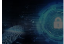
THREAT PROTECTION & CYBER SECURITY