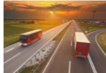
TRUCK & BUS