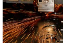
GENERAL ENGINEERING & MANUFACTURING