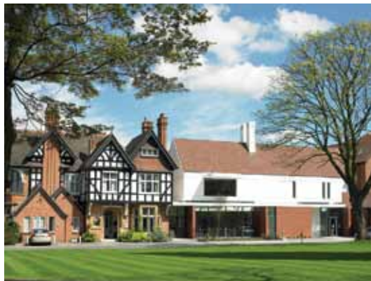
Woodland Grange, Leamington Spa